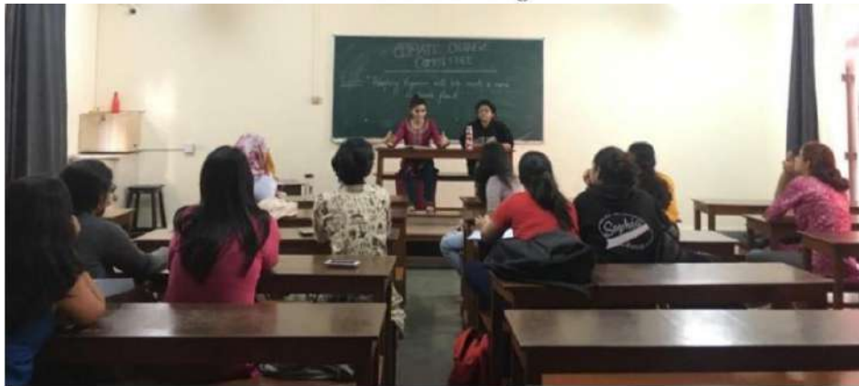
Debate on Veganism